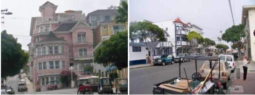
(left) Unique architectural styling; (right) Avalon business district

Finally, on the trip back to the Convention Center there will be a trivia contest based on a combination of learning experiences and just plain fun! Prizes will be awarded – and all attendees are guaranteed to win a memento of their experience on the island.