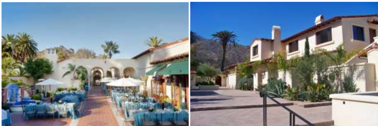
(left) Catalina Island Country Club; (right) Triana of Avalon – affordable housing